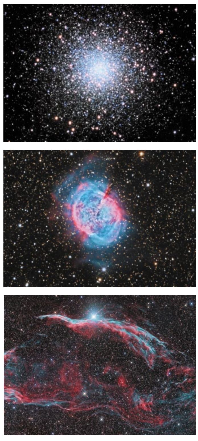
▲ FULL OF STARS Top: Globular clusters, such as M10 seen here, also make fine targets under most any skies. Middle: Planetary nebulae can easily punch through moderate light pollution. The full Moon was up while recording most of the narrowband data used in this composite of M27. Bottom: Shooting nebulae through narrowband emission-line filters (including H \alpha , O III, S II, and N II) greatly reduces the impact of light pollution and moonlight in deep-sky images. This color composite of NGC 6960, the western side of the Veil Nebula, reveals plenty of reddish H \alpha and teal-colored O III.

to a bright star, such as IC 59 and IC 63, which are tucked up very close to Gamma ( \gamma ) Cassiopeia.