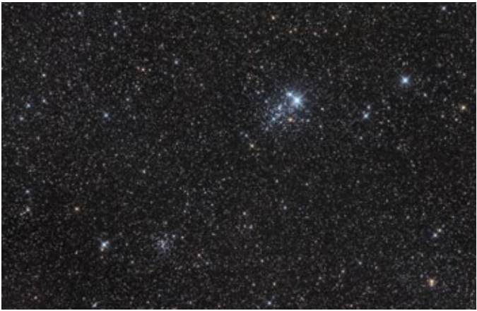
▲ BRIGHTENING SKIES Top: This map shows the intensity of light pollution in the United States, with white denoting the strongest concentrations. Bottom: Open clusters, including NGC 457 seen at middle, make great targets even in bright skies. Stacking many short exposures will keep the background from getting too blown out.

cluster is M35, and it contrasts well when framed in the same field with the more distant cluster NGC 2158.