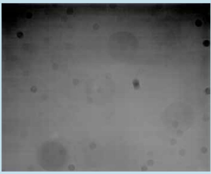
▲ Possibly the most critical calibration frame for imagers is the flat-field image. This records uneven field illumination like vignetting seen in the corners of the image, as well as the out-of-focus silhouettes of dust specks found on any optical surfaces. The smaller the spot is, the closer it is to the camera's detector.

methods described above, twilight flats produce superior results for some of my telescopes. Like T-shirt flats, this is a low-cost option, but it is significantly more challenging.