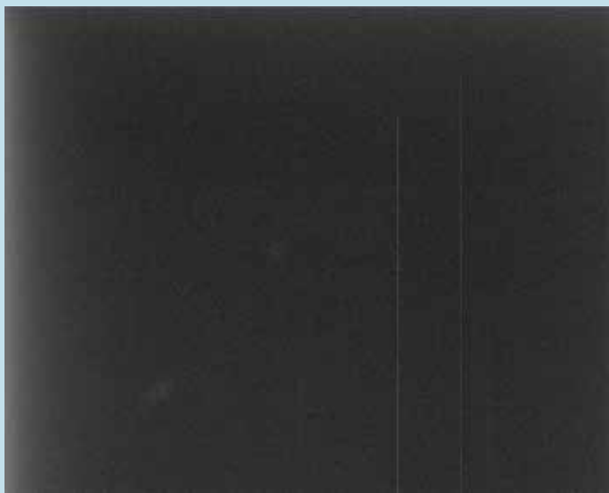
▲ Dark frames record electronic signal that builds up during an exposure. A proper dark frame needs to be shot at the same temperature setting in your camera and must be exposed for the same length as the light frames it is meant to be subtracted from. The vertical lines are due to stuck pixels and are completely corrected during dark subtraction.

with multiple filters, dust motes may be in a different place on each filter. This requires a set of flats for each filter. While opinions differ on how many flat frames to acquire, I prefer 16 flat-field frames per filter to produce a good master flat.