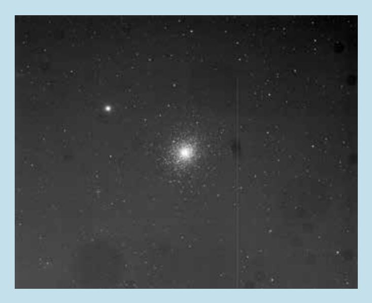
▲ This image of the globular cluster M5 in Serpens was processed without calibration frames, showing several artifacts that are easily corrected in calibration.